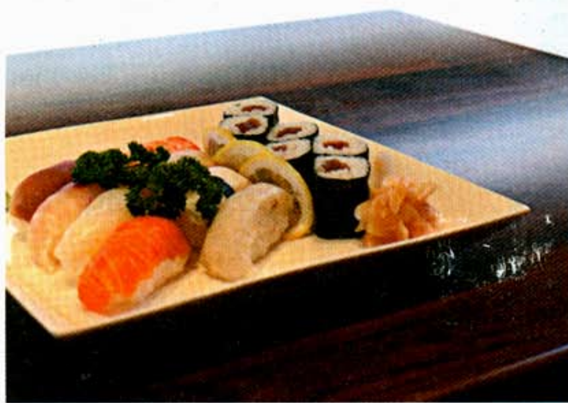
A nigiri-zushi bonanza – just one of several good value set meal options